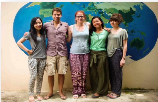
Golden Futures Volunteers 2013!

Thank you so much for taking an interest in Golden Futures. There is still a lot to offer the young children of Cambodia, and we need your support to continue to make a difference in their lives. Please visit our website, www.goldenfutures.org.uk , for details on how you can help us to give these children the opportunities they deserve!