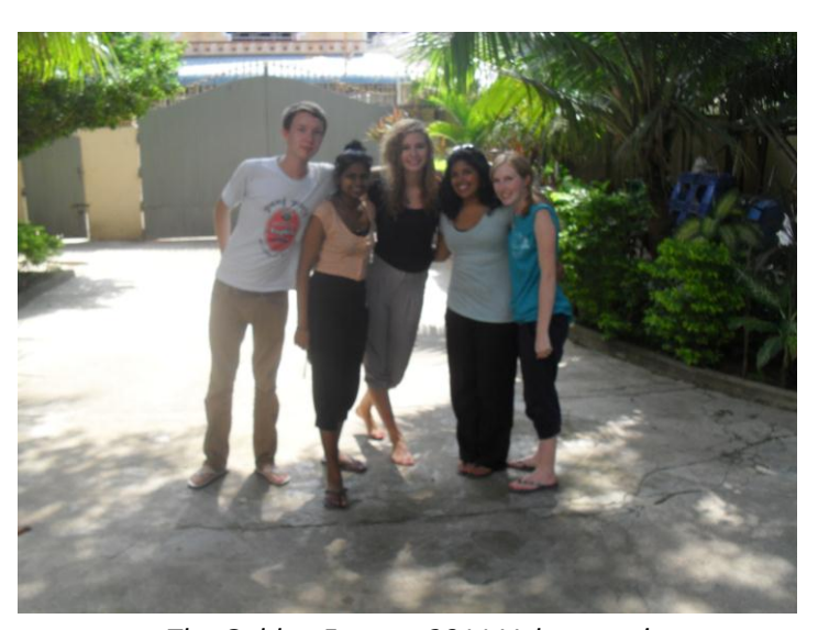
The Golden Futures 2011 Volunteers!

On top of all this, each volunteer was assigned a number of students within the orphanage to mentor. The children