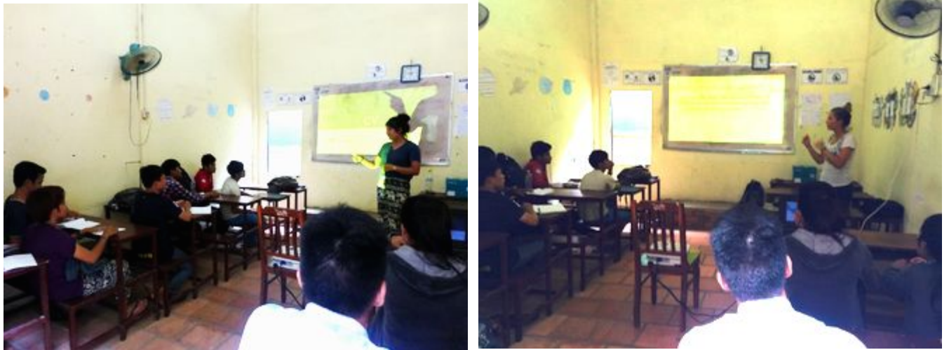
Here we are delivering our training workshops to a classroom of young adults at COLT.

We delivered these training sessions to NFC as well as other NGOs in Phnom Penh. We had successful sessions at both Cambodian Organisation for Living and Training (COLT) as well as Children for Change Cambodia. It was very rewarding visiting these NGOs as many of the students have never received any guidance on career options and employability skills, something students in the UK are often bombarded with and take granted for.